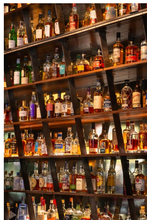
The steel framework for the iconic back bar was retained and the shelving replaced with up-cycled veneered shelving found on site. Old fluorescent lighting was replaced with warmer LED.

bar. This was the beating heart of Internasjonalen but after 20 years it needed some TLC. So, using some recycled shelving from old cupboard units found onsite we refurbished it, bringing it back to its former glory. Another key element that was important for them to retain was the ceramic tiled floor. In terms of sustainability simply repairing the floor where necessary and retaining the feature was the obvious choice.