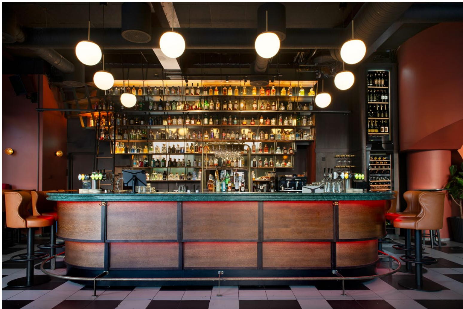
The bar counter was transformed to become the centerpiece of the space. It's U shape maximizing the seating around.

Flere foto og tegninger på interiormobler.no