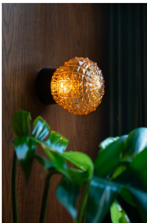
A mix of vintage and new lighting was used to create the warm and welcoming ambience.